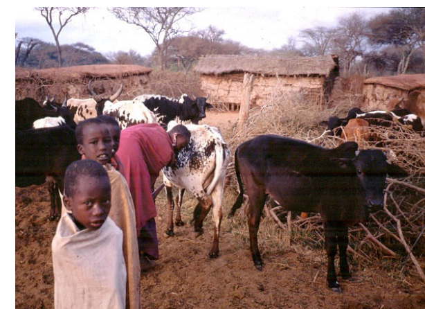
Young livestock keepers in East Africa

We are looking forward to seeing you at our public events and discussions. For further information, you are invited to contact us or visit our websites (see overleaf).