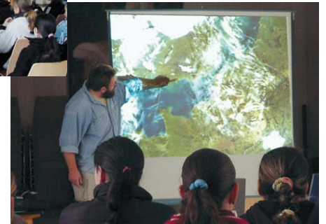
An insight into the Climate Expedition: jointly working out the roots and consequences of global climate change