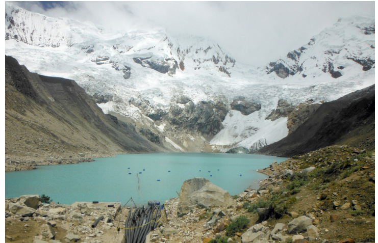
The glacial lake Palcacocha with a makeshift pump discharge system in the foreground, which is not sufficient to avoid a dangerous tidal wave.