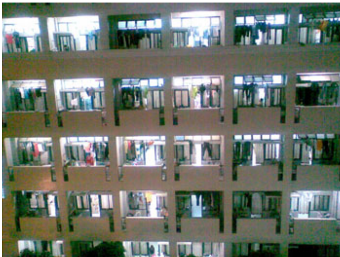
Facade of a crowded dormitory and litter discarded on a balcony where workers wash basins are also located.

Celestica says it pays the total cost of all contract workers' insurance and pensions, together with their wages, to the labour agencies. SACOM was told that sometimes, in order to save money, labour agencies employ under 18-year-olds with fake identity cards providing them only with occupational injury insurance, not social insurance. It is not known if Celestica is aware of these cases.