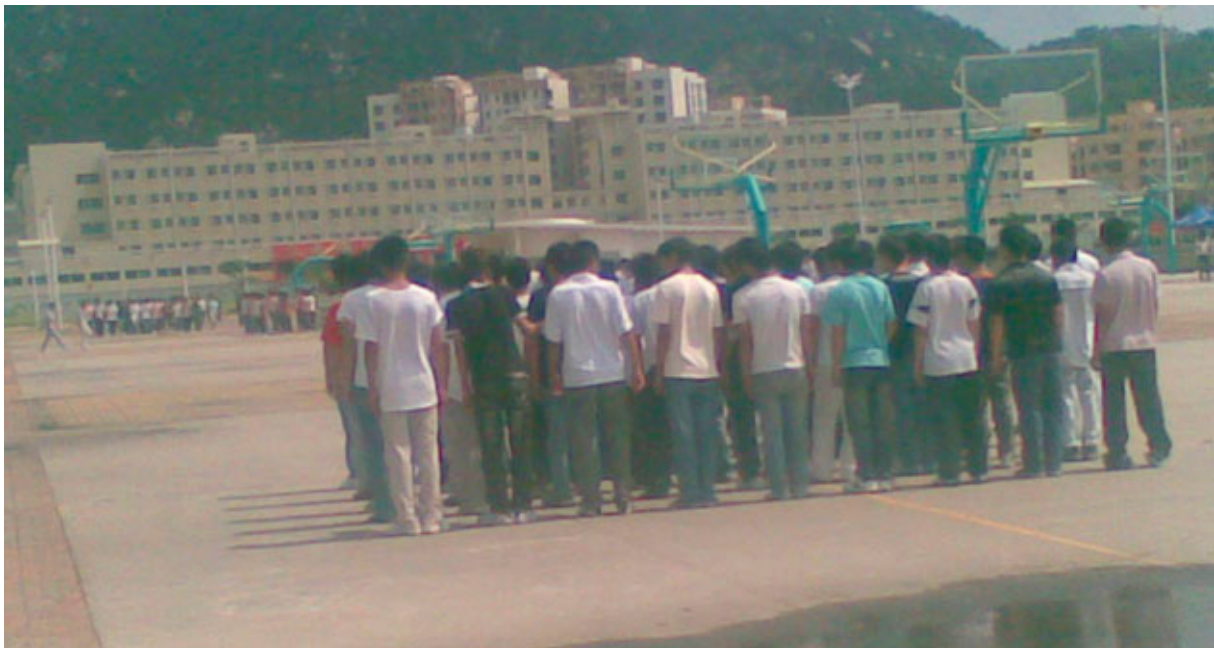
New recruits undergoing disciplinary training.