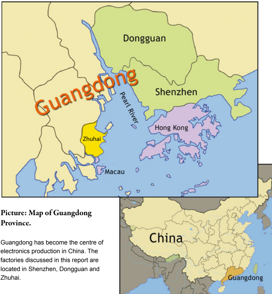
Picture: Map of Guangdong Province.

Guangdong has become the centre of electronics production in China. The factories discussed in this report are located in Shenzhen, Dongguan and Zhuhai.