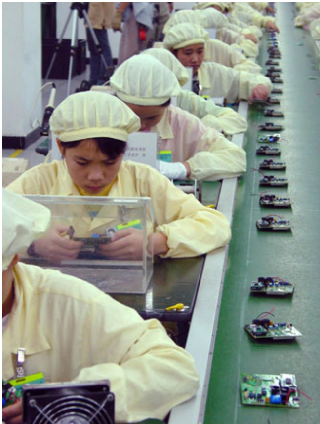
Assembly line workers in electronics factories are often women, favoured for their obedience and quick fingers. Picture is from China.

The world's biggest electronics contract manufacturers have established a firm base in China, with several factories. This report takes a look at four of them, namely Canadian Celestica, Singapore-based Flextronics International, Vista Point Technologies of Flextronics and Taiwan-based Hong Fu Jin Precision Industry, under the trade name Foxconn. 40 Foxconn and Flextronics are the world's biggest contract manufacturers of electronics. In 2007, Foxconn was also China's biggest exporter. 41 Foxconn has in all 550,000 employees and an income of US$ 51.8 billion. Flextronics employs 162,000 employees and has an income of US$ 27.6 billion. 42 It is difficult to say whether seasonal and contract workers have been included in these figures.