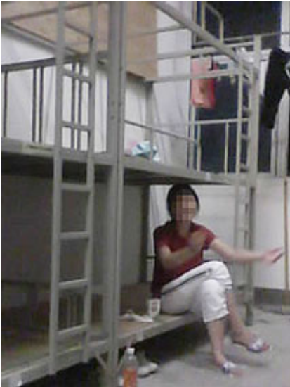
Each dormitory room sleeps 8–10 workers with very little space and privacy.

Apple's code requires dormitories to be clean and safe and provide adequate personal space.