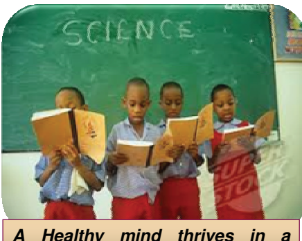
A Healthy mind thrives in a healthy body