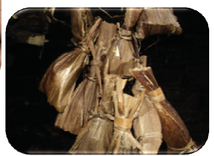
Traditional seed storage using banana fibres