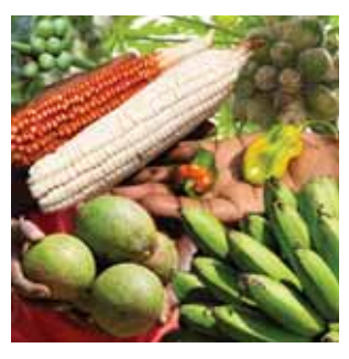
Planning of the field, variety of crops