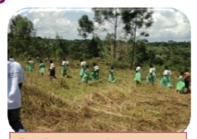
Pupils engaged in tree planting