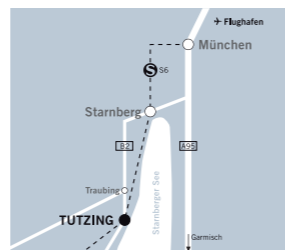
Conference No.: 0492015 Evangelische Akademie Tutzing Schloss-Strasse 2+4 / 82327 Tutzing/Germany www.ev-akademie-tutzing.de

Arrival by plane: Please, take S1 from Munich airport to München-Laim and change into S6 to Tutzing.