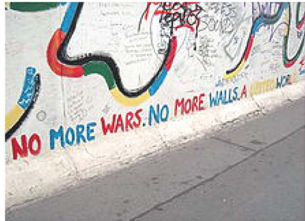
A popular graffiti slogan on one section of the East Side Gallery, reading: "No more wars. No more walls. A united world."