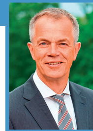
NRW Minister for the Environment Mr. Johannes Rammel

„I am pleased to support the Korean Global Renewable Energy Forum. In NRW we strongly believe in international networks and local action in order to be successful in climate protection. All levels of government need to communicate and cooperate to tackle this immense challenge.“