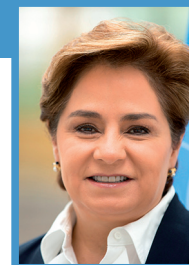
UNFCCC Executive Secretary Mrs. Patricia Espinosa

„Accelerating and scaling-up the deployment of renewable energies will be a crucial key to realizing the aims and ambitions of the Paris Climate Change Agreement. This event provides an important forum for delegates to learn at first-hand how clean energies can play their part in transforming economies and the future of humanity.“