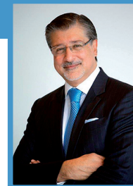
IRENA Director General Mr. Adnan Z. Amin

„In view of current climate change, rapid transition towards a sustainable energy future is needed. With the energy sector accounting for more than two thirds of global greenhouse gas emissions, the Global Renewable Energy Forum 2016 addresses the single-most important issue in current climate action: the decarbonisation of the energy sector and the need for large scale renewables deployment to achieve this.“