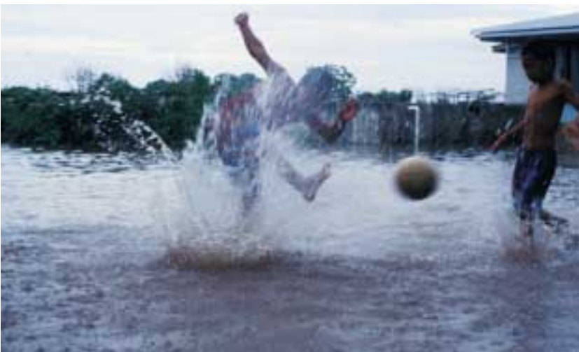
Funafuti Atoll, February 2000. "Children playing soccer in a flooded area during spring tides. The 3.2 meter high tides sparked the world's concern as they threatened to inundate the country" (Bennetts/ Wheeler 2001).

Many small islands do not protrude more than 3 to 4 meters above the present mean sea level at their highest point. Tuvalu's highest point is not higher than 3 meters. It therefore comes as no surprise that the IPCC concludes that of all the threats facing small island nations as a result of climate change, sea-level rise is "by far the greatest," both economically and socially (IPCC 2001, pp. 847 and 855).