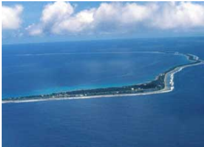
Tuvalu at its widest point is only 400 meters across

The loss of land runs counter to the rising need for permanent houses and infrastructure of an increasing population.