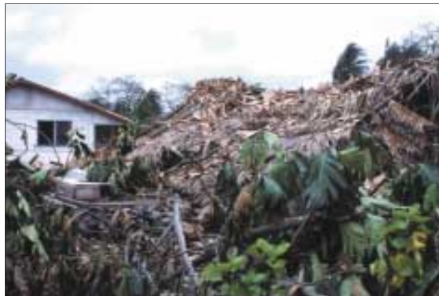
Damages caused by a storm on Vaitupu Island

Klaus Töpfer, general director UNEP; DIE ZEIT, May 8, 2002