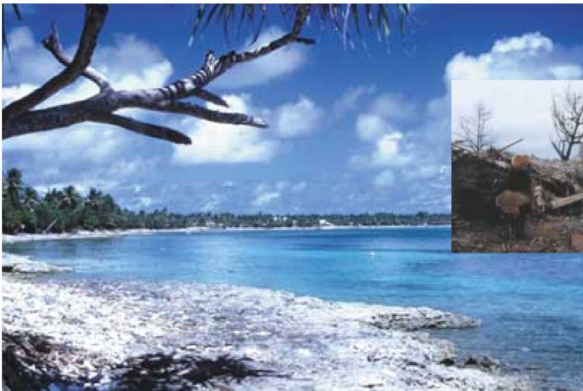
Vaitupu Island; a roof collapsed due to a storm.

(source: CIA 2003, UNDP 1999, UNDP 2003; years in brackets refer to reference year of data)