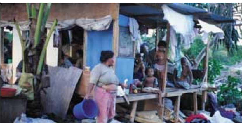
Funafuti Atoll, July 1999. Already in 1995, Tuvalu established the Funafuti Conservation Area, which prohibits fishing in specific areas in hopes of preserving stocks. The islet lies across the lagoon from the capital and is a great success. People visit the islet to picnic (Price 2003; UNFCCC 1999, p. 16; Bennetts/ Wheeler 2001).

Most of the previously mentioned adverse effects of climate change overstrains atoll countries like Tuvalu. They do not have the capacities to react and adapt in an adequate manner. This results from a combination of different factors including limited access to capital and technology, human resources and technology or simply relates to the size of the country. In many cases the only possible option is migration, both internal and external (IPCC 2001, p. 864).