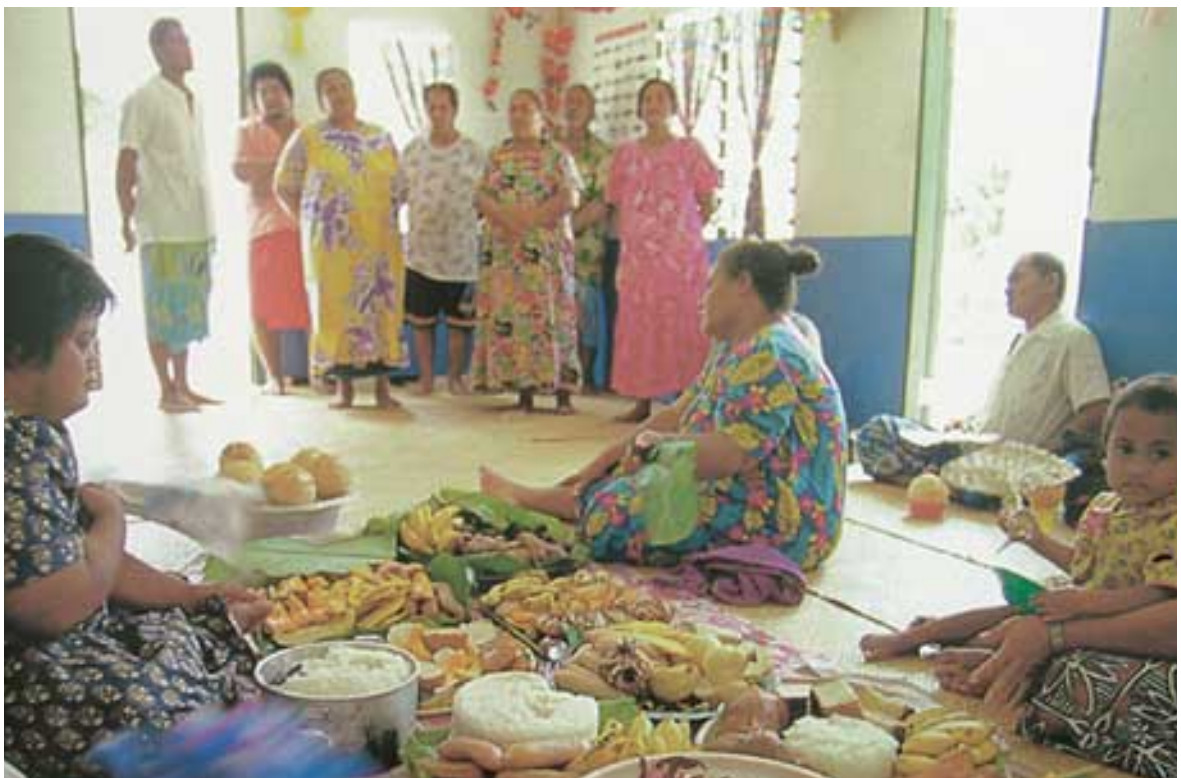
"Nukufetau Atoll, May 2000: Coconut crabs. "Tuvaluans love their food, perhaps because, in the past, food supplies were not always guaranteed. In fact food on these small and densely populated atolls could be frighteningly scarce at times. Frequent cyclones and droughts could wipe

out months of supplies. Even now, cyclones, droughts, and, more prosaically, delays in the inter-island shipping schedule, can leave outer atolls short of foodstuffs. The only resource that's (almost) guaranteed is fish." (Bennetts/ Wheeler 2001)."