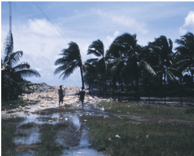
Drinking water is scarce on Tuvalu. Not only the intrusion of salt water into the freshwater lens is a problem but also the dumping of waste pollutes the water.

The increase of both, the solid and liquid wastes, is threatening to contaminate the underground drinking water and the adjacent sea water, which would increase algal cover, algal blooms, and coral loss (UNFCCC 1999, p. 29).