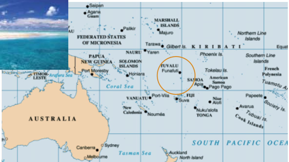
figure: map_SOA_UN.pdf (United Nations Cartographic Service)