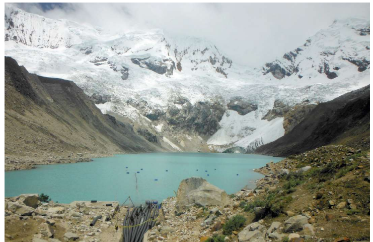
The glacial lake Palcacocha with a makeshift pump discharge system in the foreground, which is not sufficient to avoid a dangerous tidal wave.