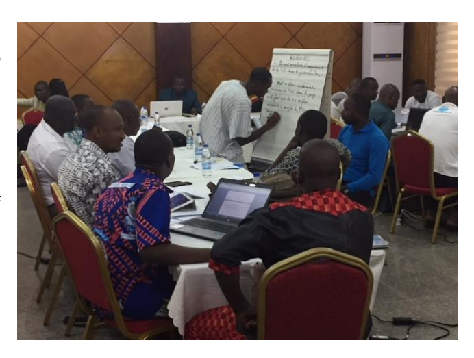
Working atmosphere at the regional workshop in Abidjan.

In 2018, the project provides an opportunity to enhance engagement on the GCF through